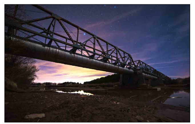
"Rio Grande Blues" by Victor Gibbs