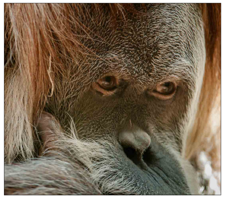
"Orangutan Blues" by Dave Brown

Of course, "the blues" can also refer to police and military uniforms; any number of sports teams; certain groups of butterflies; and even some