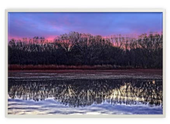
Edit That Photo "Reflection" by Victor Gibbs.