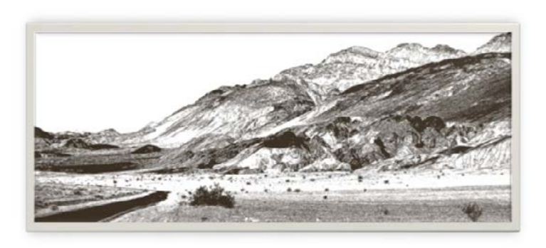
Edit That Photo "Death Valley Etching" by Anne Chase.

This is the fourth class in the 5-part photography boot camp series